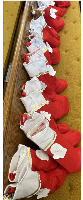
Filled stockings for Manchester Family Service