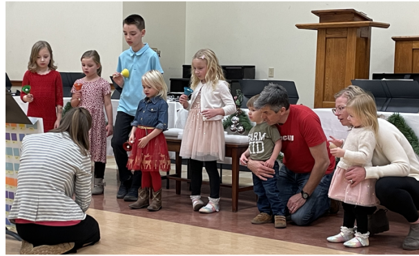
Family Christmas Program