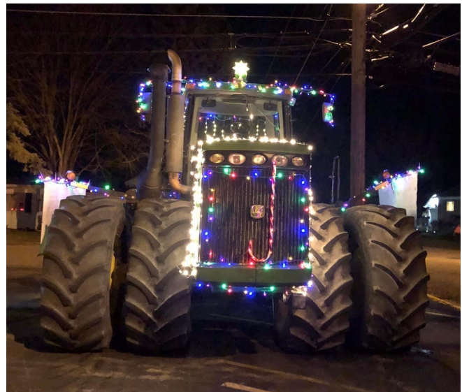
Our parade walkers and the Huehl Acres tractor